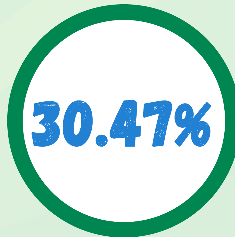
Overall Voter Turnout 2022 1