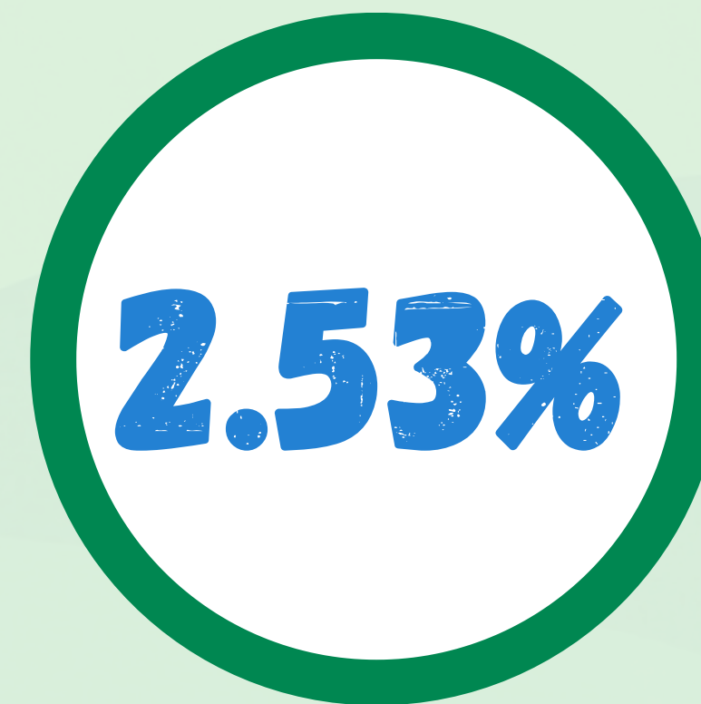
2.53 % decrease compared to the 2019 2 Local Elections.