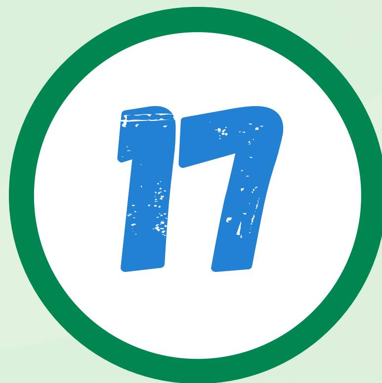
BwD is a unitary authority consisting of 17 wards.